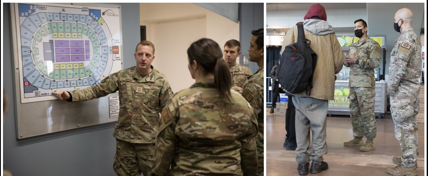
Members of the Colorado National Guard provide support to civil partners at a warming center at the Denver Colosseum, Denver, Dec. 21, 2022. By order of Gov. Jared Polis, the Colorado National Guard was activated to assist the state emergency operations center (EOC) with extreme cold weather operations in Denver metro and surrounding areas due a cold front expected to reach a -50 degree wind chill.