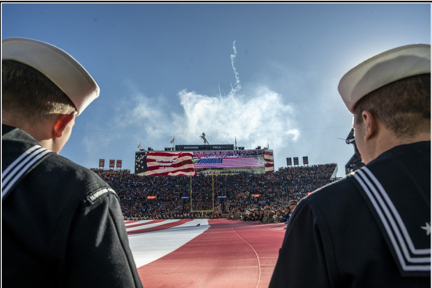
Two members of the military contingent hold a portion of the U.S. Flag during opening ceremonies at the Denver Bronco's Salute to Service game, Invesco Field at Mile High, Sunday, November 20, 2022.